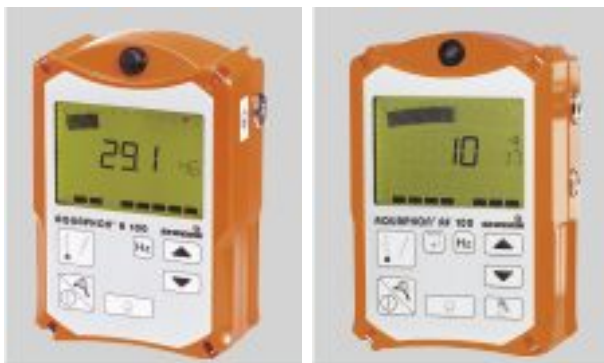
AQUAPHON® A 100

Indoor leaks in inaccessible places are detected using the small, handy EM 30 microphone with short probe tip. There is also a magnet, tripod and compact case available specially for indoor use.